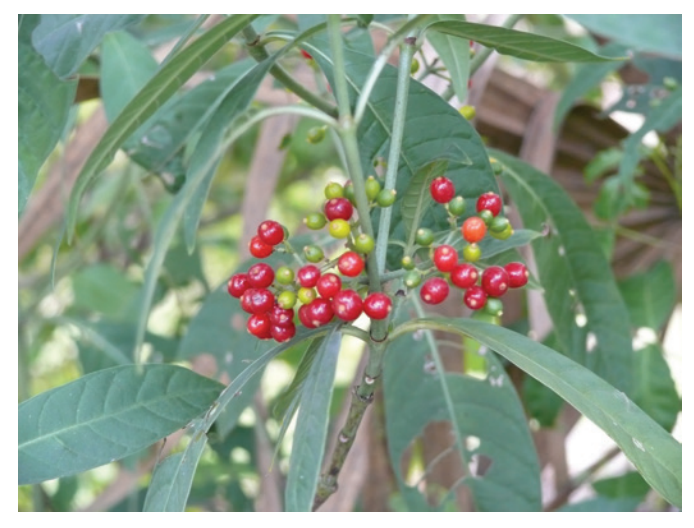
Psychotria tenuifolia drupes.