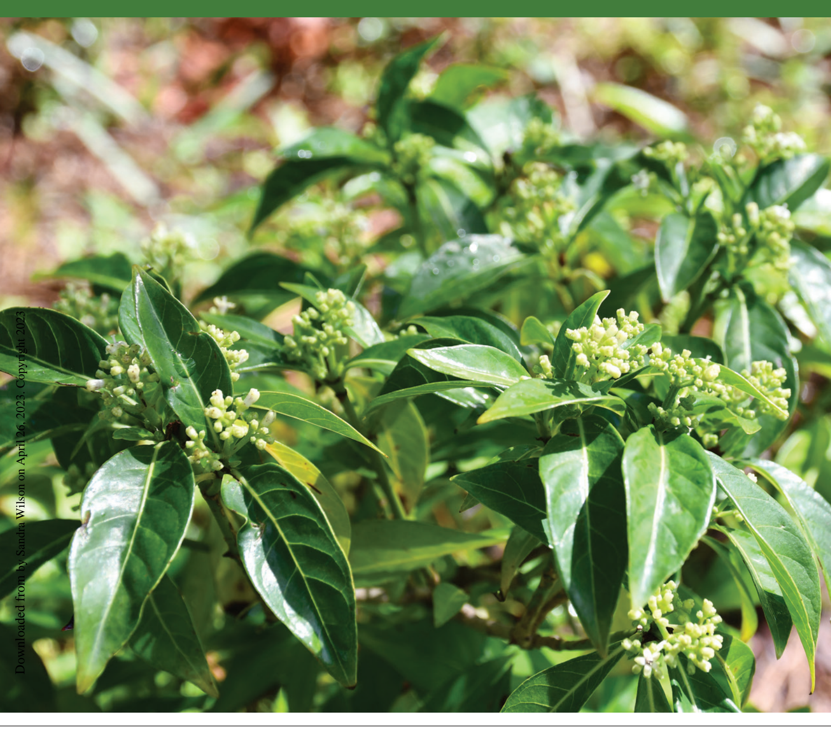
Flowering Psychotria ligustrifolia (Northrop) Millsp. (Rubiaceae).